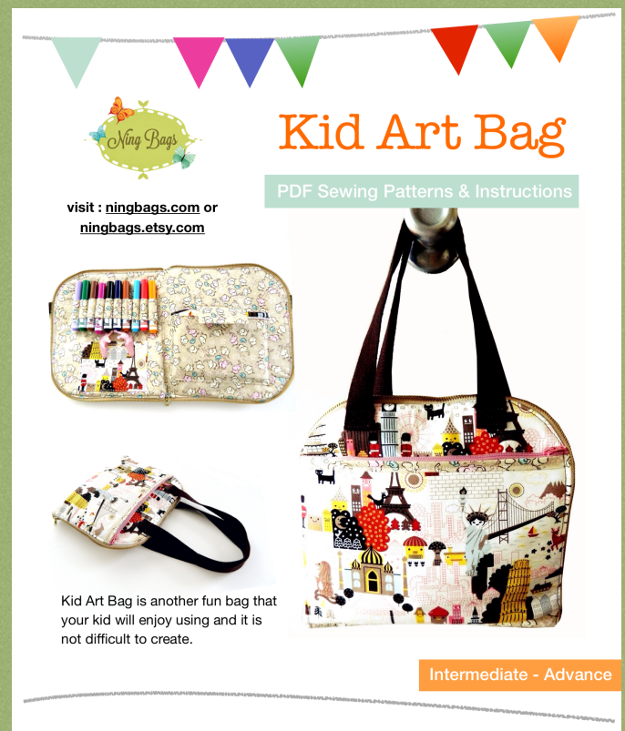
Kids Art Bag